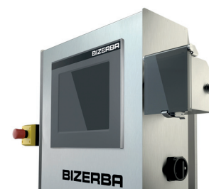
12" color touch screen