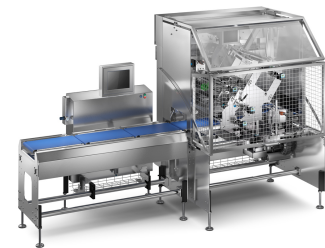
GLM-levo CleanCut with safety cover metal mesh