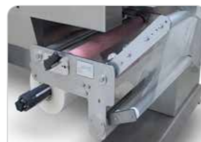
Motorized film unwinding