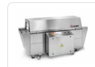
TR300 Top open shrink tunnel