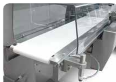
Empty bags blower