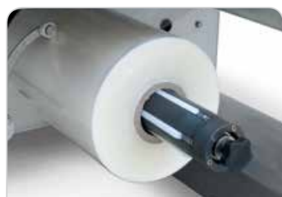
Pneumatic reel holder