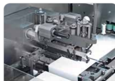
Cross sealing jaws