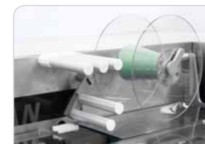
Film scrap collector